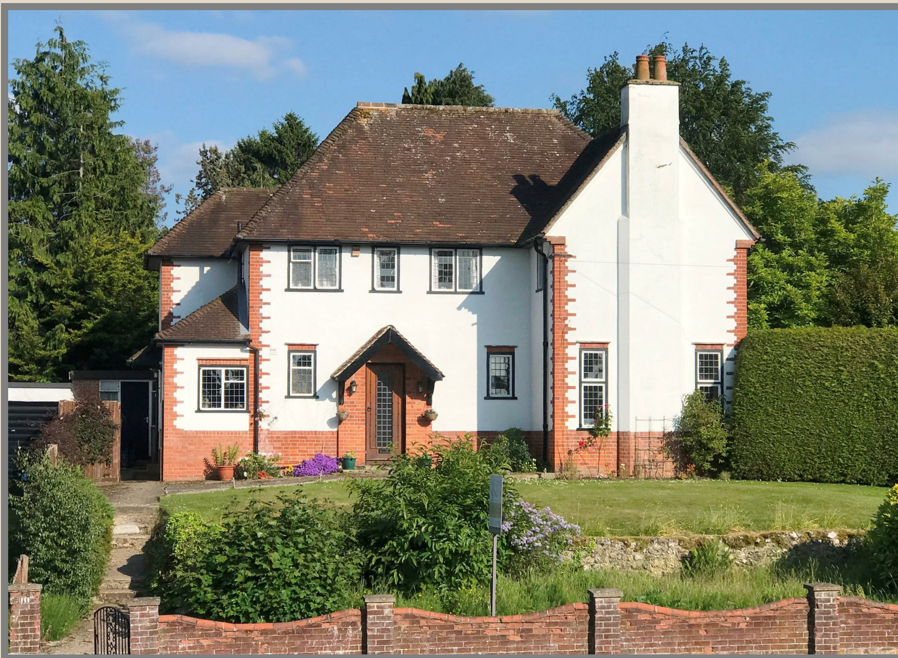
Kimberley Lodge, Andover Road, Newbury, RG14 6JH